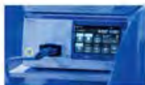
VISERA ELITE III